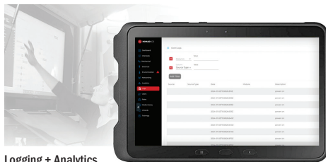
Logging + Analytics

NTC is built for simple, seamless control of CMOC systems, from power and mechanical, to connectivity and data management. Easy-to-use wizards provide step-by-step guidance on deployment, stowage, and other operational procedures and are configurable to meet your mission needs.