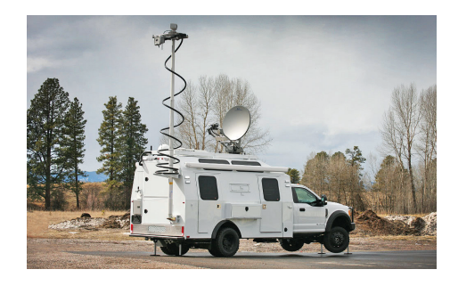
Sacramento County Sheriff: Tactical Command Vehicle (TCV-X)