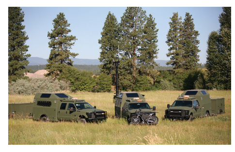
U.S. Army Europe: TCV Command + Emergency Transport Vehicles