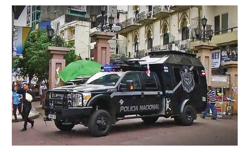
Panama National Police: Tactical Command Vehicle (TCV)