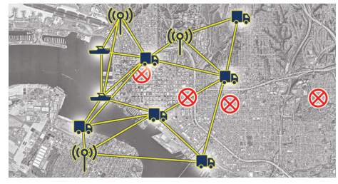
Mobile assets can be repositioned to restore mission-critical connectivity